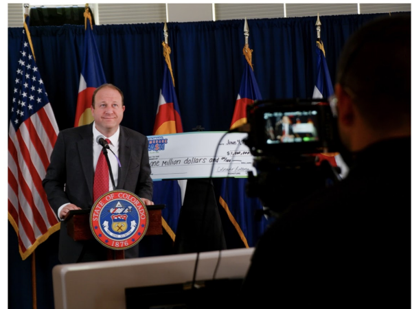
Colorado Gov. Jared Polis announces a $5 million sweepstakes for people who are vaccinated against COVID-19. He was speaking at the governor's mansion in Denver on Tuesday, May 25, 2021.

An estimated 70% to 80% of Coloradans must be vaccinated in order for the state to reach herd immunity.