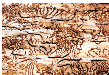
Figure 3: Tunneling by Ips hunteri in blue spruce.