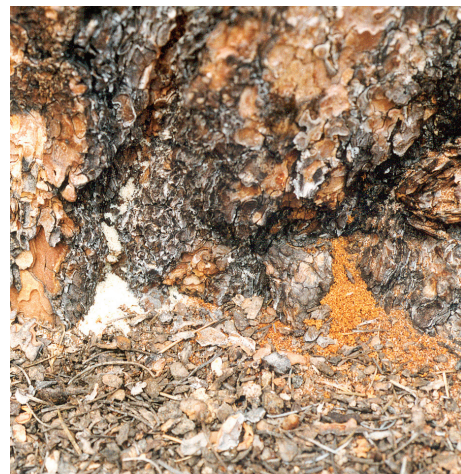
Figure 2: Boring dust at the base of a pine tree. Reddish boring dust is caused by ips beetles. The whitish dust is from ambrosia bark beetles.

Insecticides used to prevent ips include either permethrin, bifenthrin, or carbaryl (Sevin) as the active ingredient. There are many products currently on the market containing these active ingredients. Follow