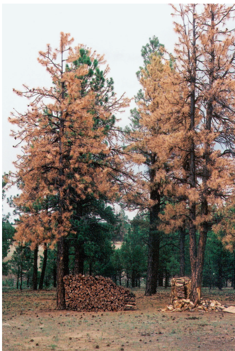
Figure 5: Storing cut firewood near susceptible trees greatly increases the risk of ips beetle attack.