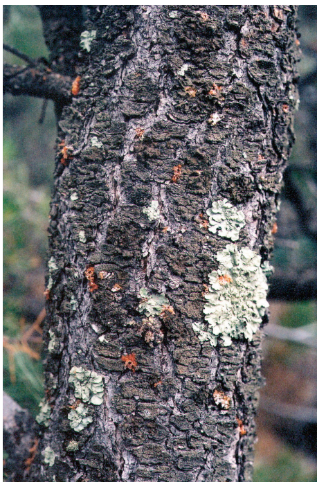
Figure 6: Ips confusus pitch tubes on infested pinyon pine trunk.

the manufacturer's recommendation for the proper rate for bark beetle treatment. Bark beetle applications at the labeled rate should provide at least three months control of ips beetles.