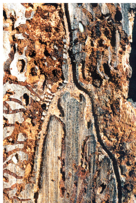
Figure 7: Ips pini egg galleries under bark of ponderosa pine trunk.

No chemical treatment exists for trees or wood already infested by ips beetles. In rare cases where it is feasible to reduce the threat to live trees by killing beetles within infested trees before they exit, treatments involve bark removal, chipping the wood into small pieces, covering piles with a double-layer of 6-mil thick clear plastic sealed around the edges with soil to heat (solarize) the wood, or physical removal of infested material from the site to an area a mile or more from susceptible trees.