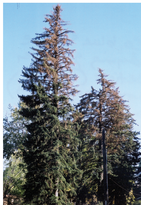
Figure 4: Top dieback of spruce from drought stress and ips attack.