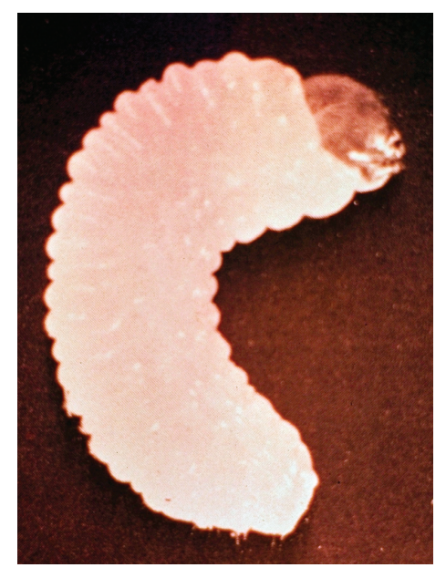
Figure 5: Larva of MPB (actual size, 1/8 to 1/4 inch). They are found under the bark in tunnels.