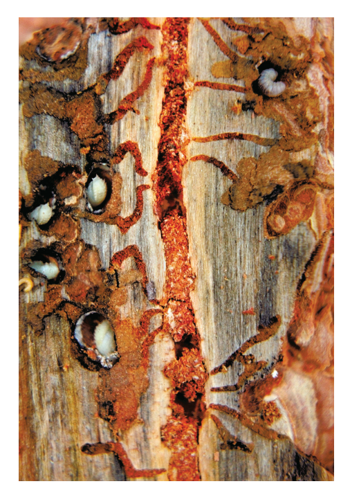
Figure 8: Characteristic tunnels (galleries) of mountain pine beetle made by the adults and larvae. The underbark area looks like this in late spring. Bluestained wood is caused by fungi the beetles introduce.

Misidentification of healthy trees: Under dry conditions, trees may not produce pitch tubes when infested, therefore healthy trees are not as obvious. Time may need to be spent looking for sawdust around a tree's circumference and at the base of the tree.