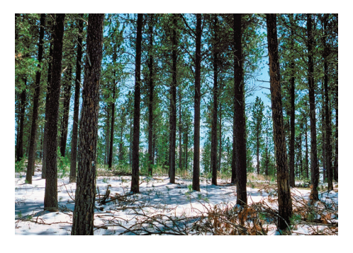
Figure 11: The appearance of a forest thinned to help prevent MPB. This can also improve mountain views and reduce fire hazard.