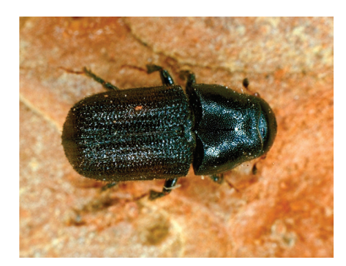
Figure 3: Top view of adult MPB (actual size, 1/8 to 1/3 inch).