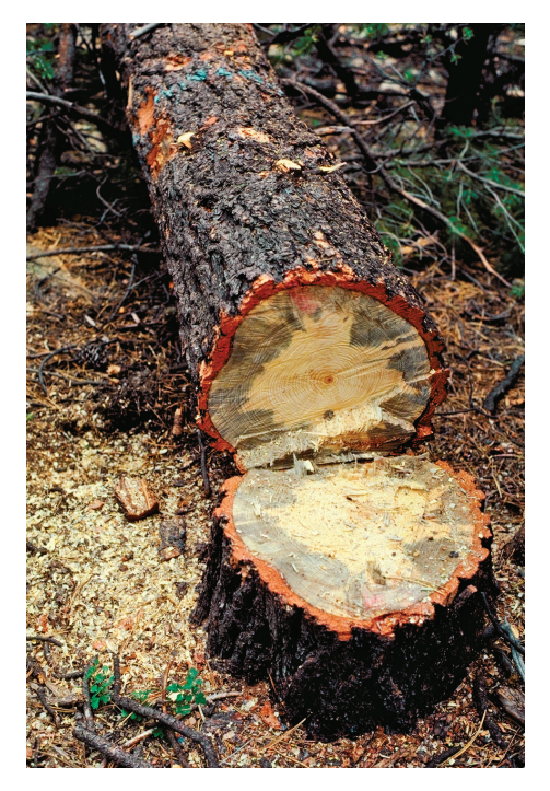
Figure 9: Cut tree killed by MPB, showing the characteristic blue-staining pattern.