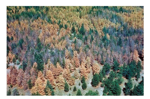
Figure 4: Mountain area infested by MPB, showing three years of mortality. Old, dead trees are gray; newly killed trees are straw yellow or orange. Some trees may also be infested but do not turn color until nine months or so under attack.