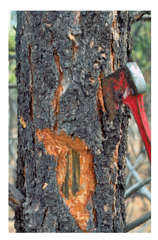
Figure 7: Checking beneath the bark for MPB. This attack was successful (note tunnels and stain).

One very effective way to kill larvae developing under the bark (though very