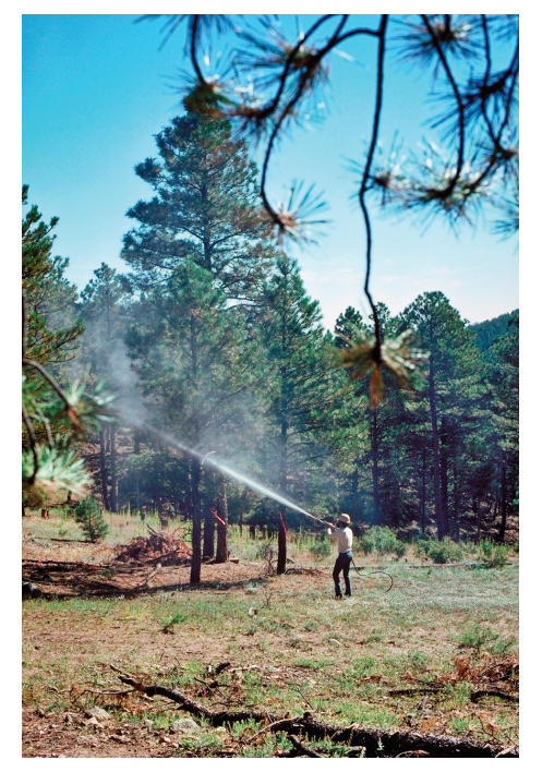
Figure 10: Large, uninfested pine being preventively sprayed. This protects high-value trees and should be done annually between April 1 and July 1.