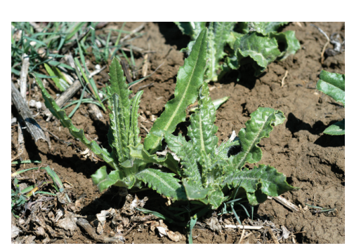
Figure 1: Canada thistle rosettes growing from creeping roots in early spring.

Control, the most common management strategy, reduces a weed population to a level where you can make a living off of or