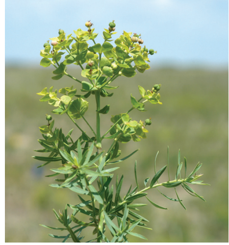
Figure 3: Leafy spurge flowering to seed set growth stage.