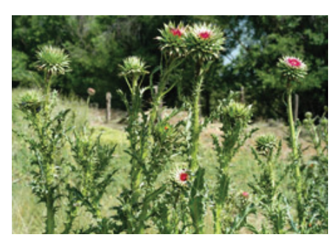
Figure 5: Musk thistle flower bud growth stage; note large spade-shaped bracts under developing flower.

Biological control methods use an organism to disrupt weed growth. Often the organism is an insect or disease and a natural enemy of the weed. This is called classical biological control. Classical is not the only form of biological control. Livestock can be effective weedmanagement tools if managed correctly. However, improper livestock management (overgrazing) can be extremely damaging to the environment and exacerbate weed problems.