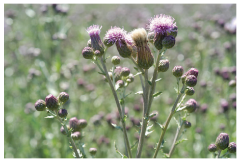
Figure 2: Canada thistle flowers and flower buds.