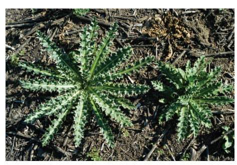
Figure 4: Musk thistle rosettes; note cream colored mid-rib and frosted appearance of leaf margins.