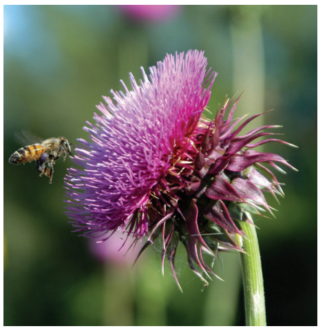
Figure 6: Musk thistle flower; note lack of stem leaves beneath flower.

Musk thistle (Figure 4, 5, and 6) is a biennial. The key to successful management is to prevent seed formation. Musk thistle occurs in pastures in direct proportion to moisture and sunlight. The weed grows more in pastures in poor condition than those in good condition. Reseeding, once its populations are reduced, may be a necessary final management step to prevent reinfestation by musk thistle.