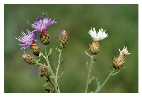
Figure 8: Diffuse knapweed flowers; color varies from white to purple; note well-developed fringe on sides of bracts and long terminal spine on bract tip; brack tips can be dark colored.

Cut off the weed below the soil line with a hoe or a shovel before the bud stage or treat the weed in spring or fall with herbicides. Apply Tordon at 0.25 to 0.5 quart/a, Milestone at 3 to 5 fluid ounces/a or Vanquish/Clarity + 2,4-D at 0.5 + 1.0 quart/A to musk thistle rosettes.