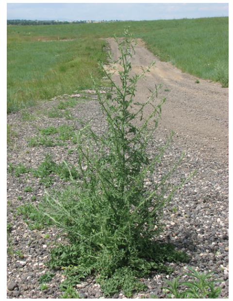
Figure 7: Large diffuse knapweed plant.